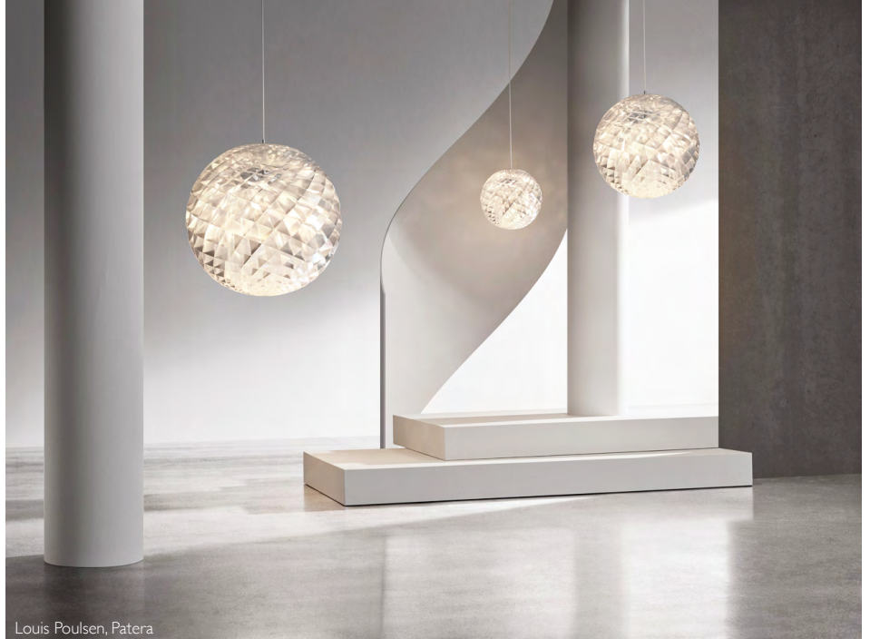
Louis Poulsen, Patera