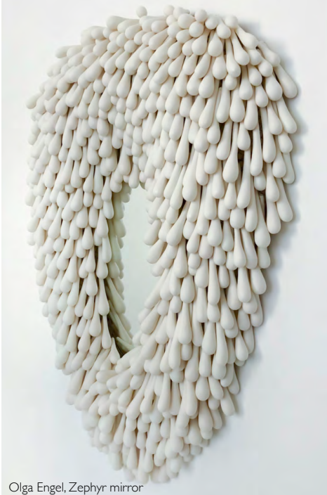
Olga Engel, Zephyr mirror