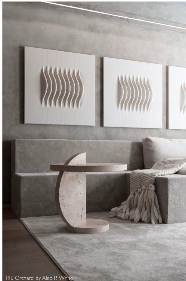
196 Orchard, by Alep P. White

If white is symbolically related to purity, light, and appears today as a major shade, it is no coincidence. Indeed, the furniture and interior design community has widely implemented different shades of white recently, on every continent. Either the choice of delicacy, of grace, enough to rise each object of that color to the higher rank. Also, there is a certain taste for its global and monochrome use, as if the nuance had taken over, submerging projects, objects, from the most humble to the most luxurious. Like if white everywhere is a new normality. But what is hiding behind the white?