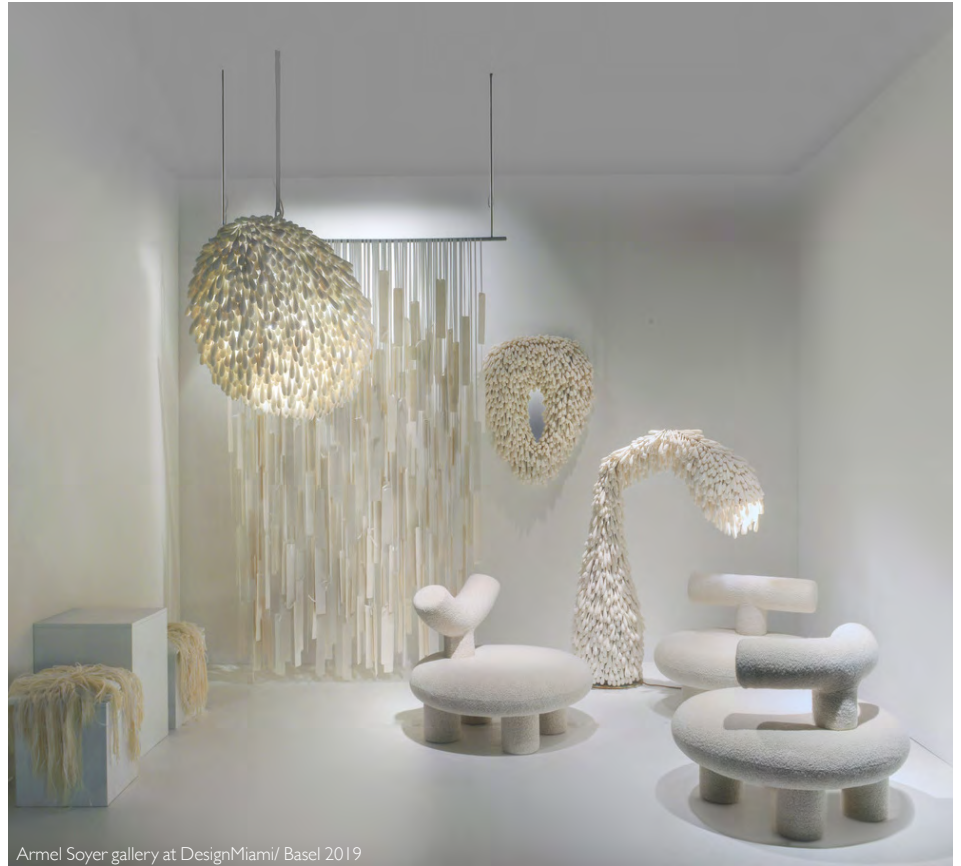
Armel Soyer gallery at DesignMiami/ Basel 2019