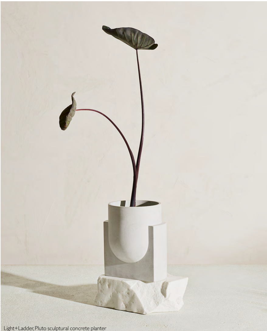
Light+Ladder, Pluto sculptural concrete planter