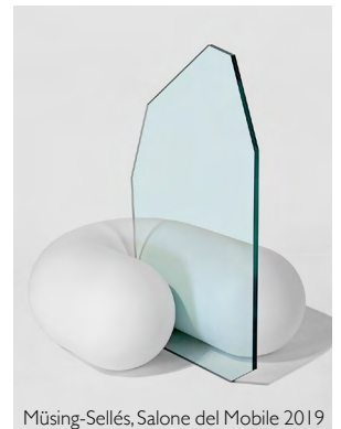
Müsing-Sellés, Salone del Mobile 2019