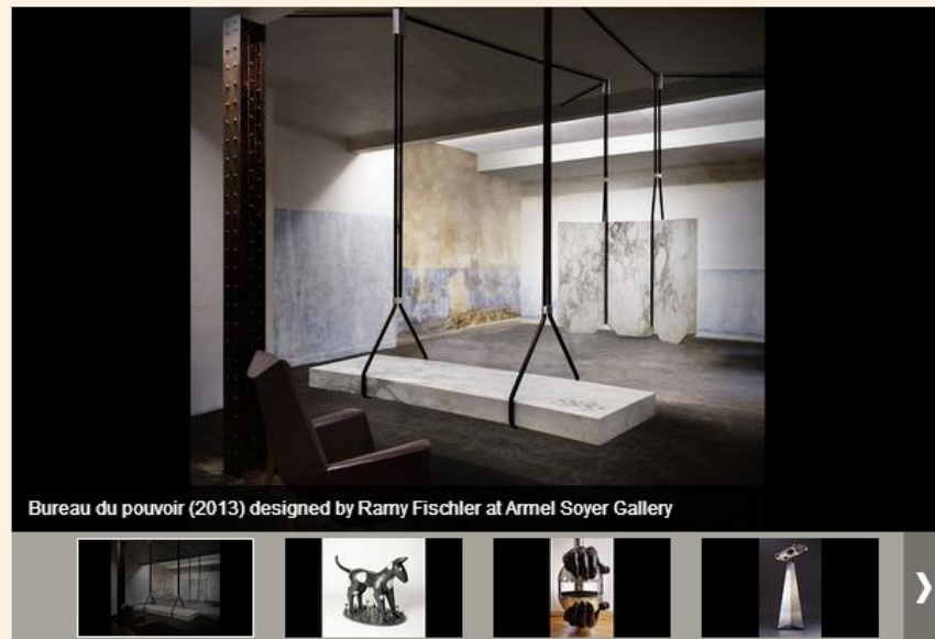
Bureau du pouvoir (2013) designed by Ramy Fischler at Arnel Soyer Gallery

Some 50 galleries from 13 countries will bring in great international names in design while a special programme has been launched for large-scale works